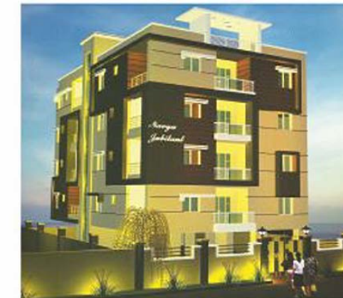
NAVYA JUBLIANT Film Nagar