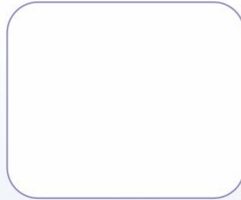
Navya Chandra Homes Nagole Metro Station - Plot No.119