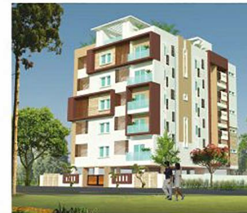
Navya Elegance Kondapur - Hyderabad