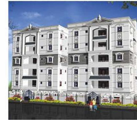
NAVYA CLASSIC Adj. Nagole Metro Station - Plot No. 786