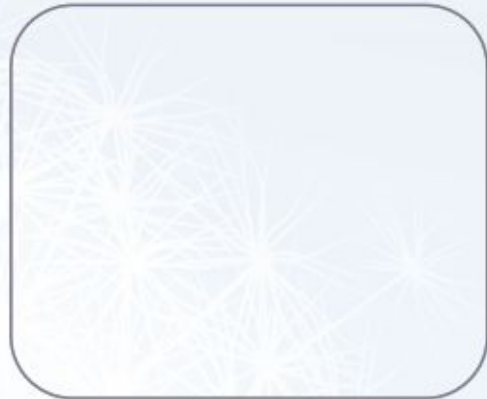
Navya Lingala Castles Nagole Metro Station - Plot No. 64