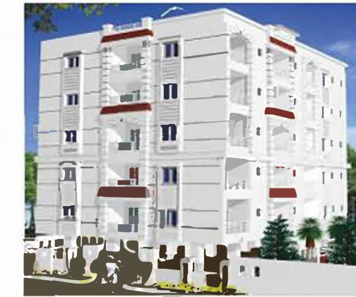
NAVYA GRUHA SRK Puram - Kothapet