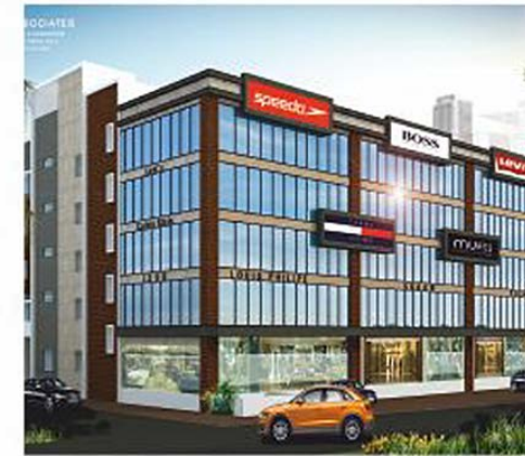
NAVYA VAZEER ESTATES Commercial Mall - L.B. Nagar