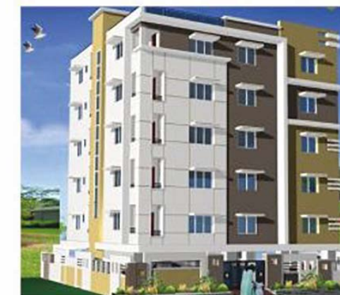
NAVYA PEARL Samathapuri Colony, Nagole