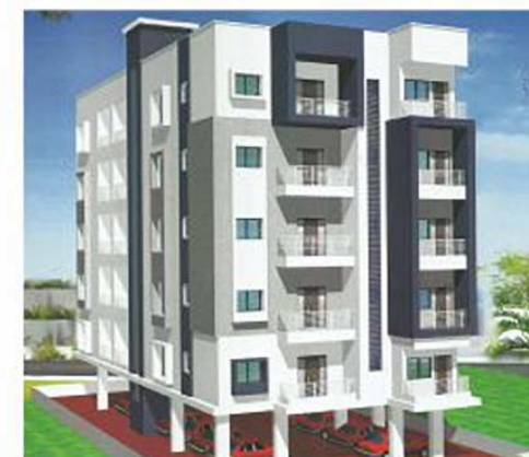
NAVYA LOTUS Phanigiri Colony - Chaitanyapuri