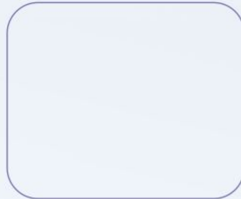
Navya Vazeer Homes Nagole Metro Station - Plot No.1352