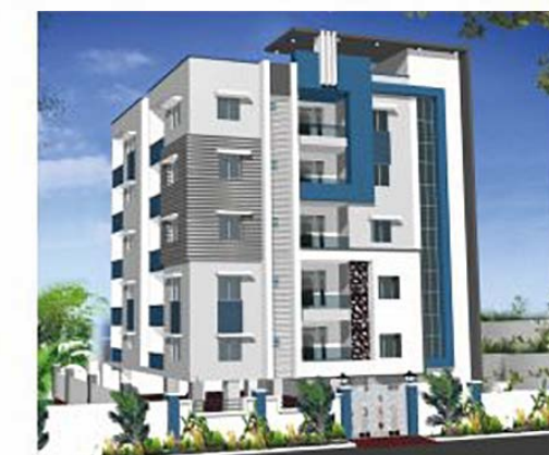
NAVYA PETALS Lalithanagar - Nagole